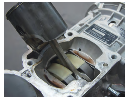
The pistons suffered only minor scuffing.